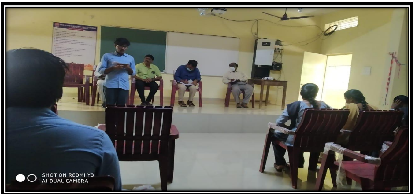
Students singing songs in a singing competition