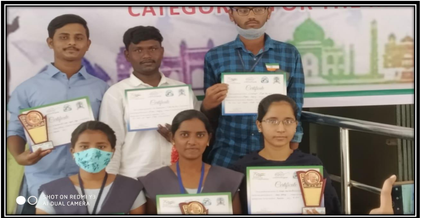
The students who stood out as the final winners and won the prizes