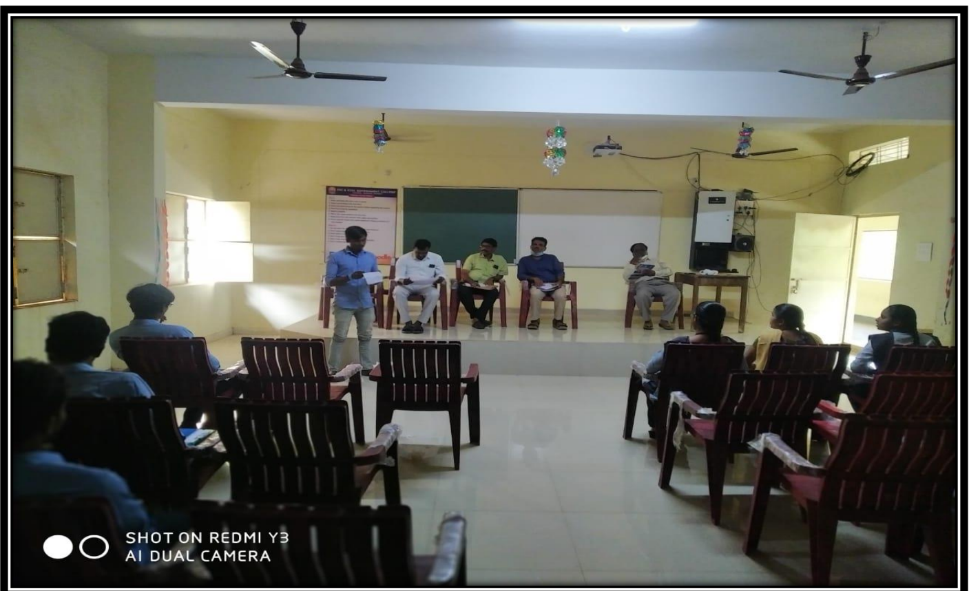
Students singing songs in a singing competition