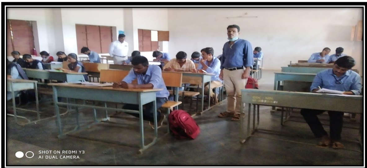
Students Participating in an Essay writing competition