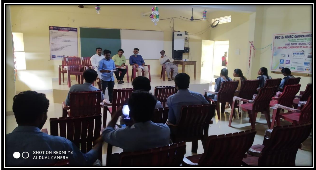
Students singing songs in a singing competition