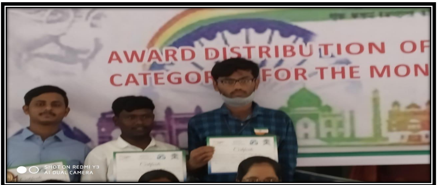
The students who stood out as the final winners and won the prizes