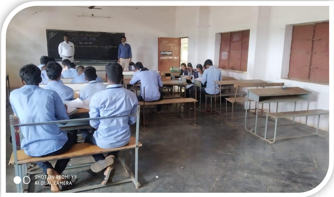
Students participating in an Essay writing competition