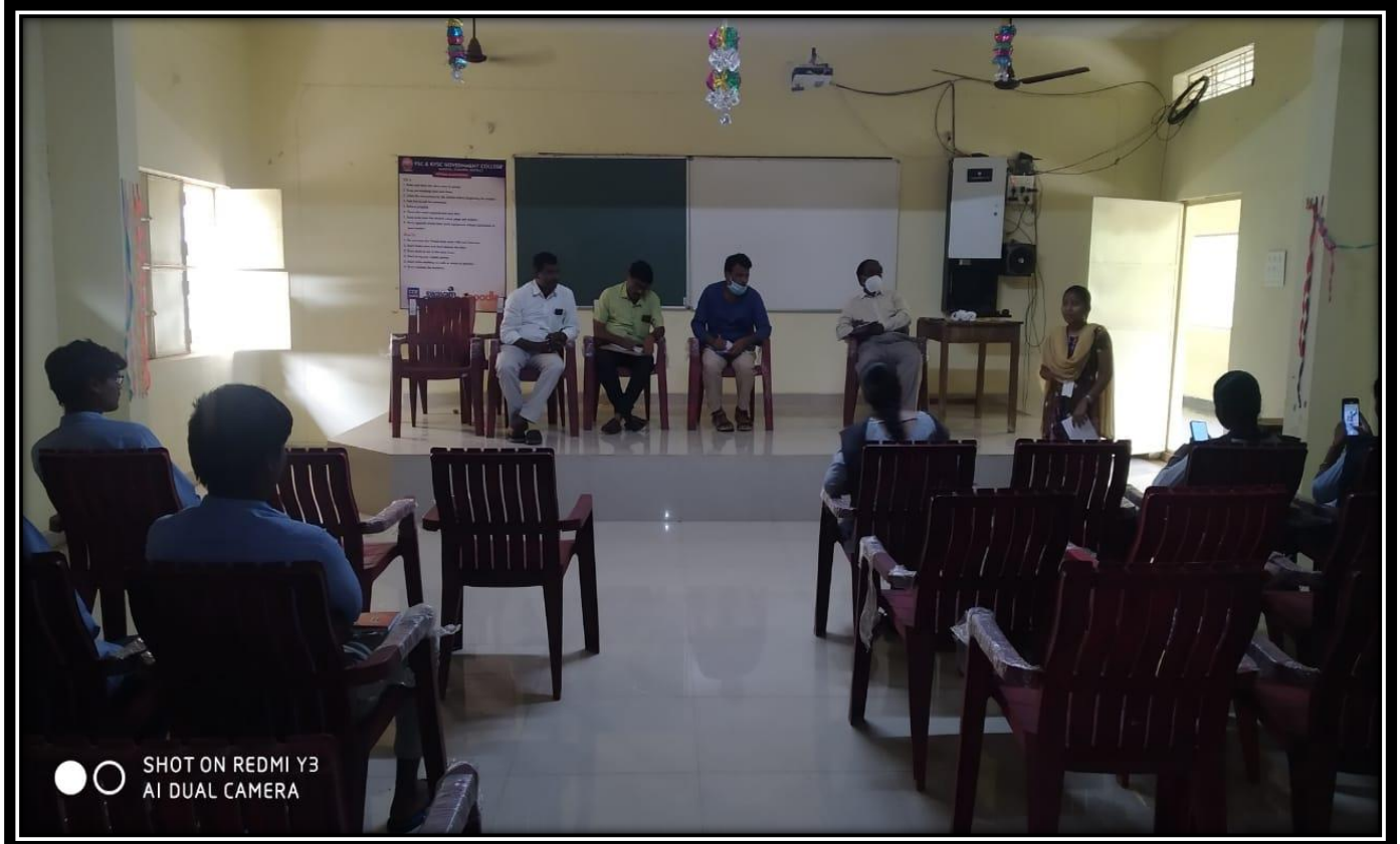
Students singing songs in a singing competition