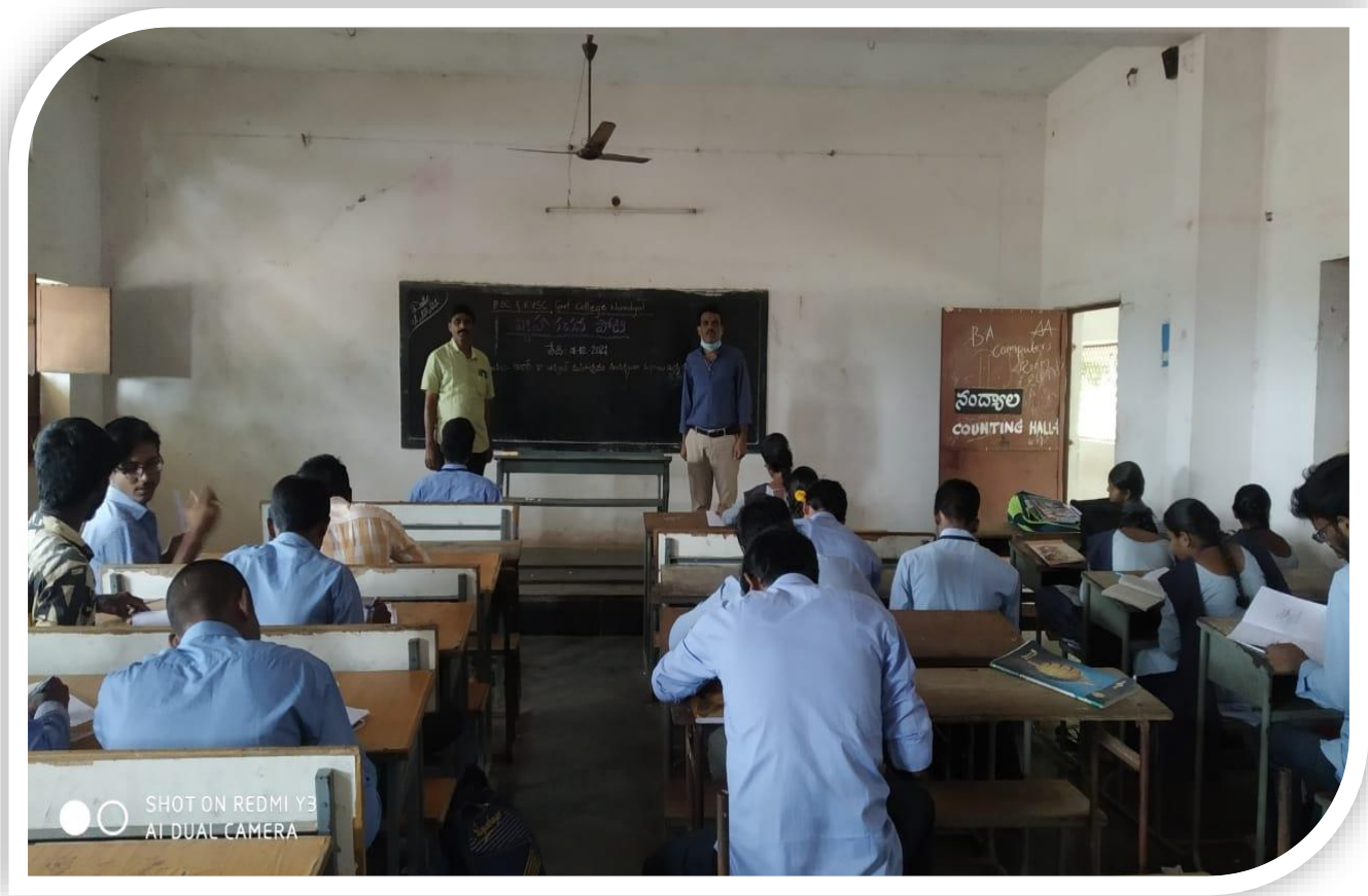
Students Participating in an Essay writing competition