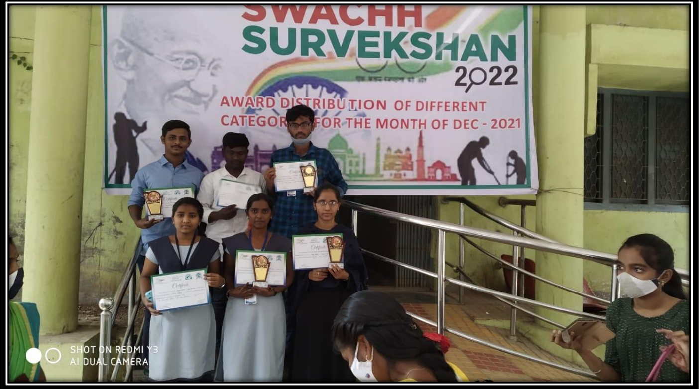
The students who stood out as the final winners and won the prizes